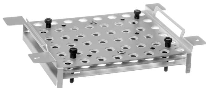
Without the 11/12 mm top plate in position.

The multi rack is now ready for use on your TurboVap LV system.